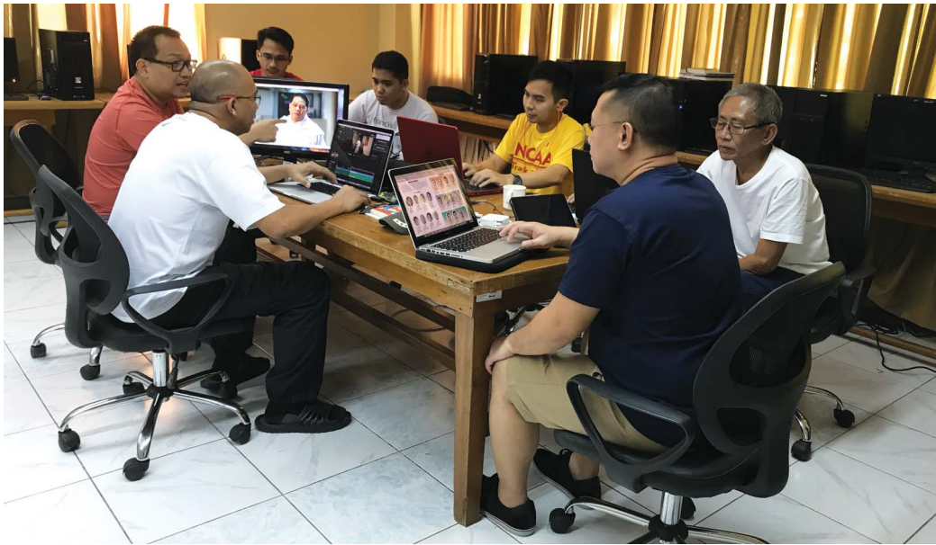
The members of the Chapter Secretariat in action.

CEBU CITY —With an ambitious plan to achieve success comes great preps and synergy.